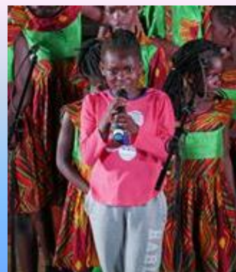
Abaana New Life Choir