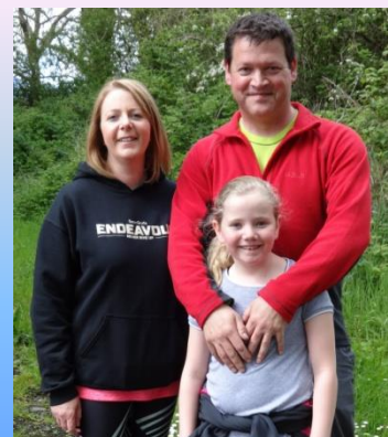
Christian Aid Walk