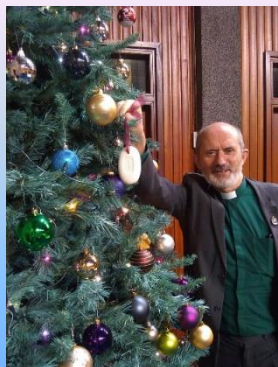
SOAP BUILDS HOPE

Worship God, Build His Kingdom, Share His Love