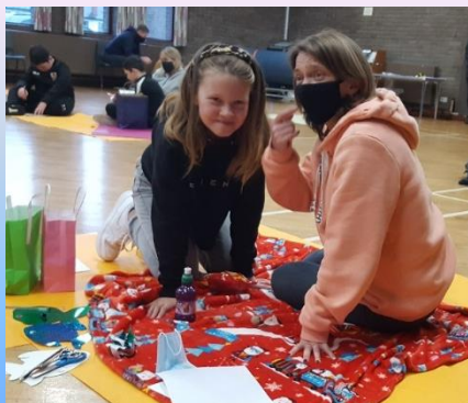
KID'S CHURCH IS BACK