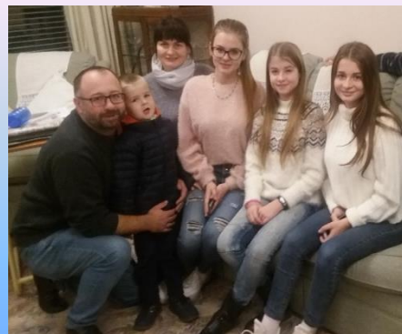
HELLO FROM UKRAINE