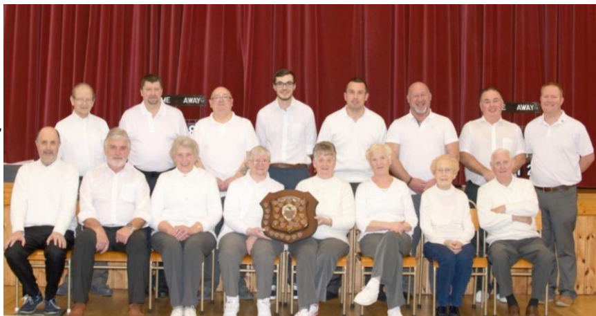
First Larne – Engravers Shield Final Team 2016