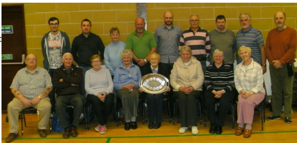
Stinson Shield Team 2016

This year we came out victorious winning the annual encounter at home for the first time in 5 years.