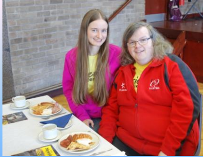
The big breakfast haircut