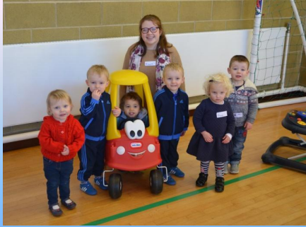
A new car for the Toddler's